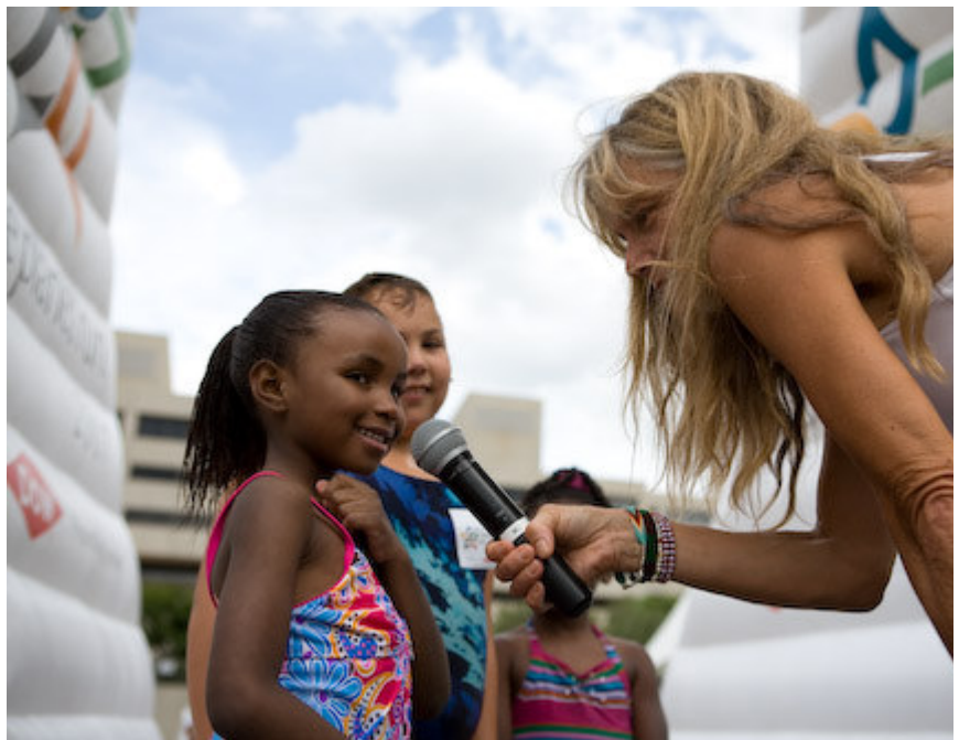
Dot speaks with a young girl on the exchange point stage in Kansas City