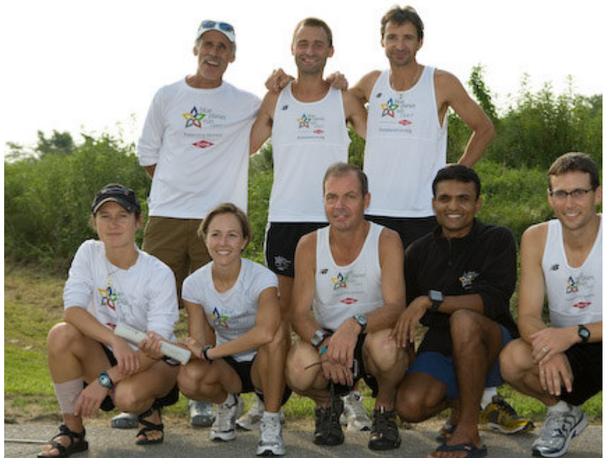
Teams Orange and Yellow together at an exchange near Kansas City